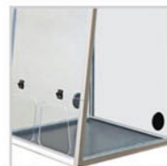
Three Side Glass Windows Back&Side glass windows maximize light and visibility, providing a bright and open working environment