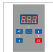
LED Display Digital LED display: Airflow Level