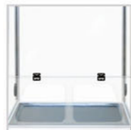
Folding acrylic front window, down part with free stop function