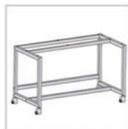
Base Stand Optional